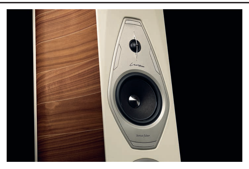
ABOVE: The tweeter and mid are located on a mini-baffle, decoupled from the main baffle and fitted with its own acoustic chamber. Note the mini-baffle's 'lyre shape' recalling the Lilium's cross-section